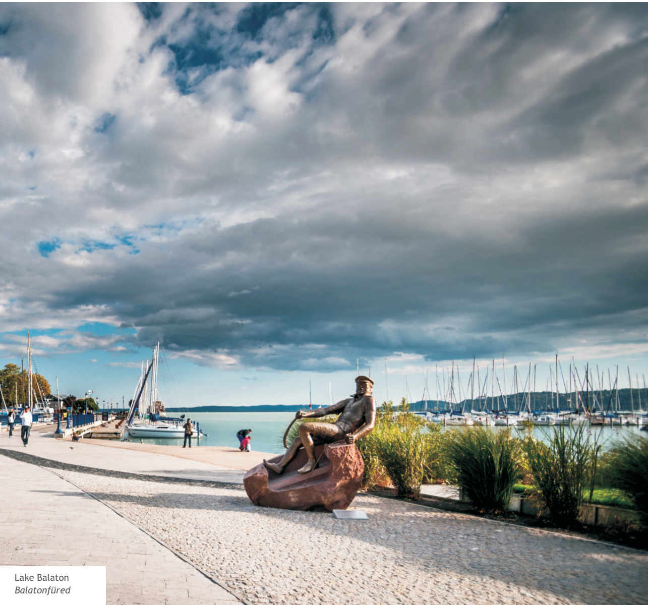
Lake Balaton Balatonfüred

Today, Balatonfüred is the principal center of Hungarian sailing. Year after year, top-ranking sailing events are organized by the local clubs and the Hungarian Yachting Association which has its headquarters also here. Apart from excellent sailing conditions, the charming restaurants and vineyards as well as a wide range of accommodation make Balatonfüred a very attractive place for sailors from all over the world.