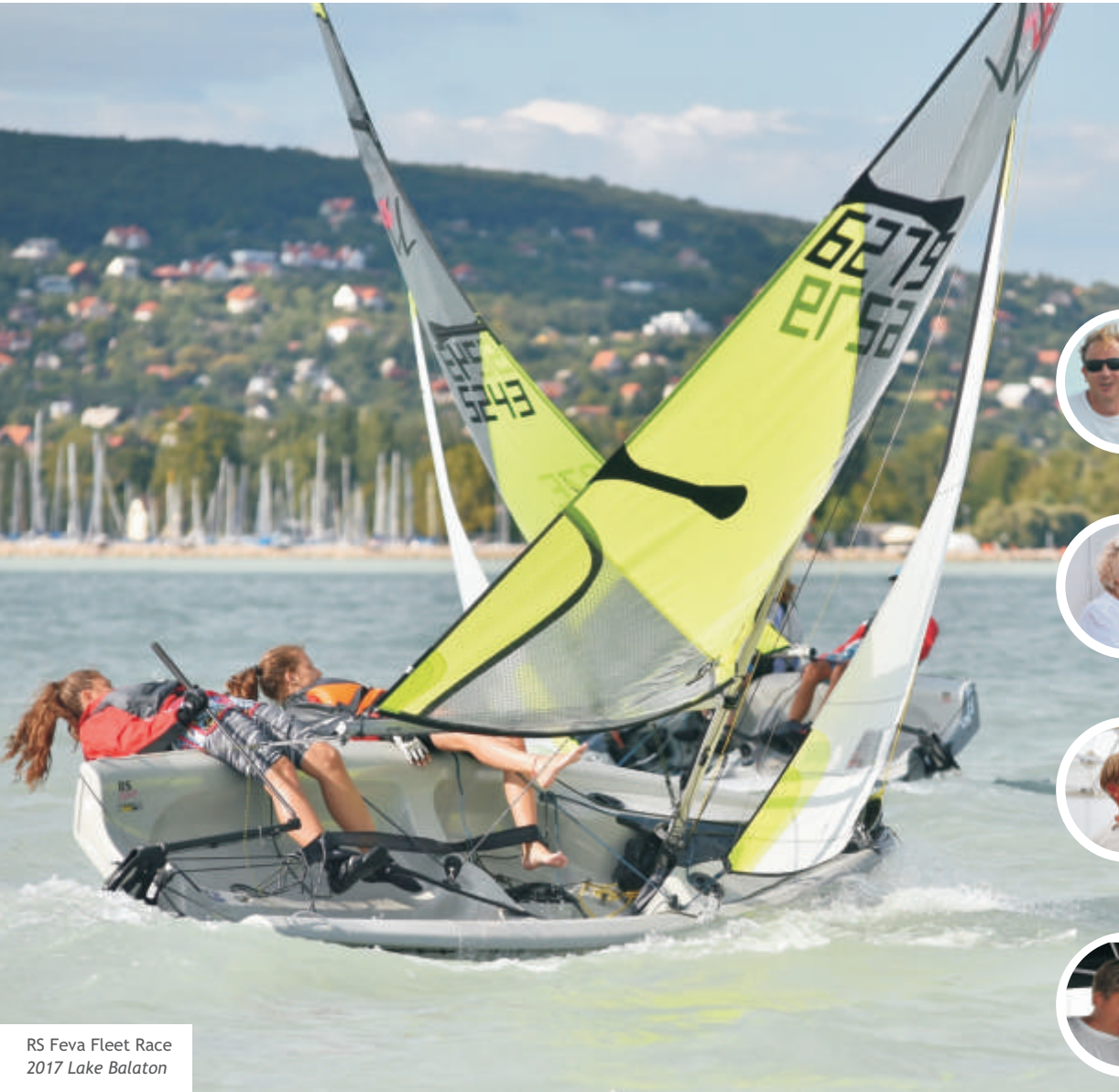
RS Feva Fleet Race 2017 Lake Balaton