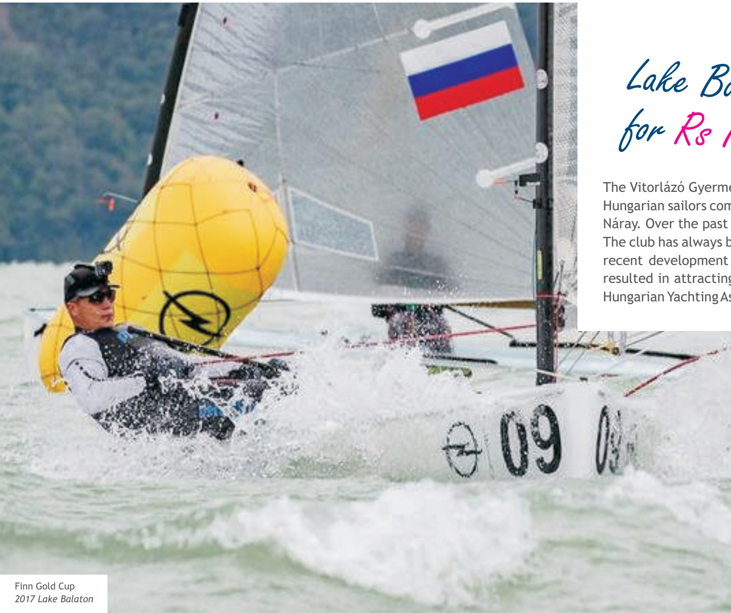
Finn Gold Cup 2017 Lake Balaton