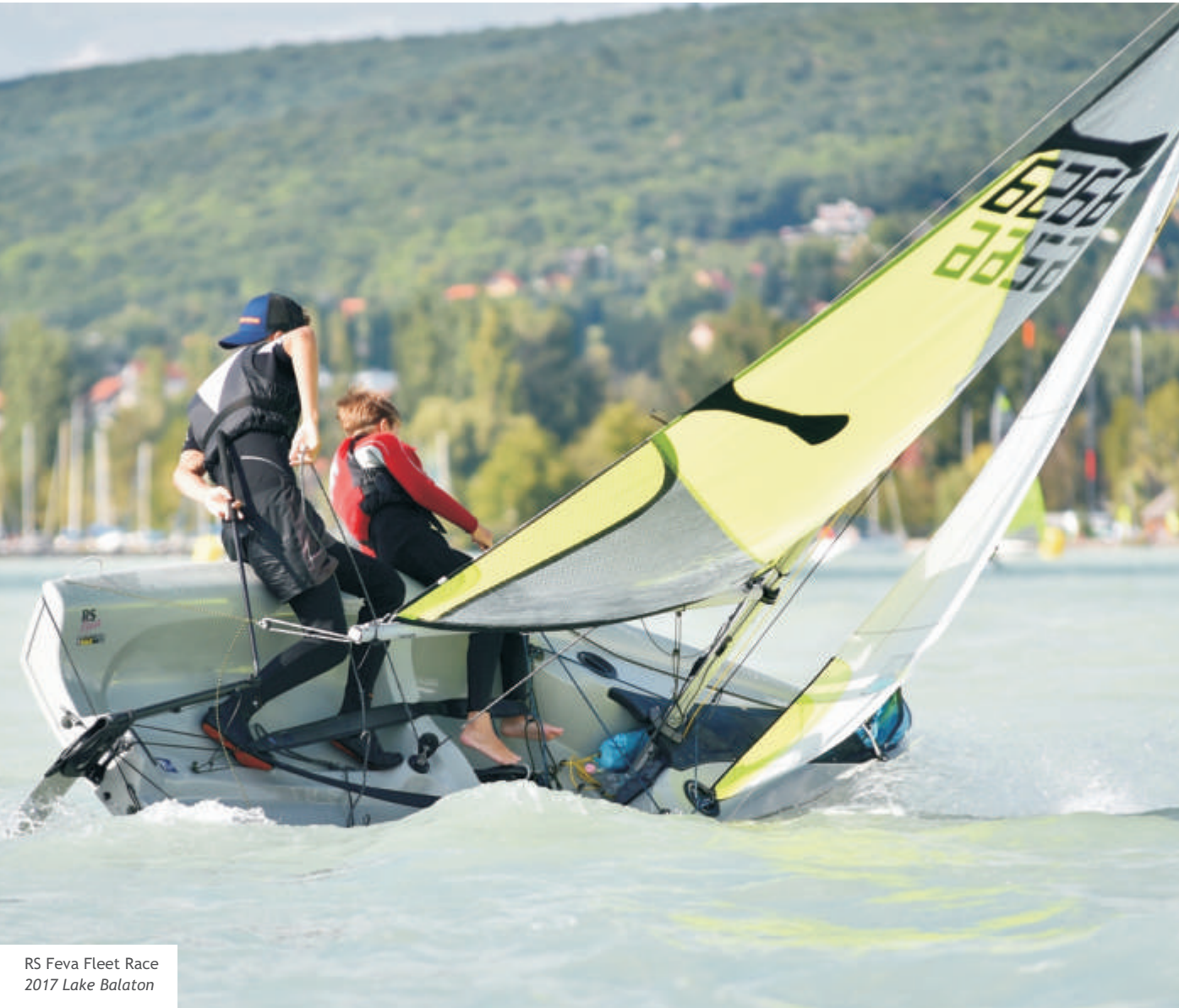
RS Feva Fleet Race 2017 Lake Balaton

Hungarian Yachting Association | World Sailing's Hungarian national member association has been supporting the development of the RS Feva class since its birth in Hungary. The HYA acquired a fleet of 32 boats in 2017 and distributed them to its member clubs to strengthen their youth sailing education efforts. The Association has been closely cooperating with VGYE and its chairman to develop youth sailing in Hungary since 2012.