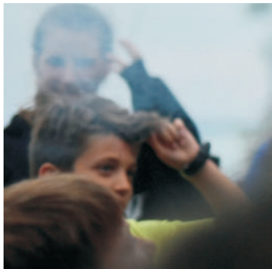
RS Feva Fleet Race Party 2016 Lake Balaton