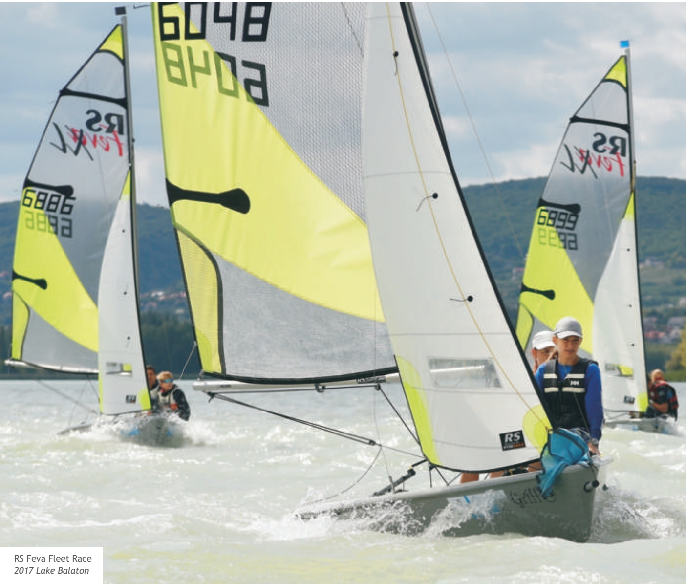
RS Feva Fleet Race 2017 Lake Balaton